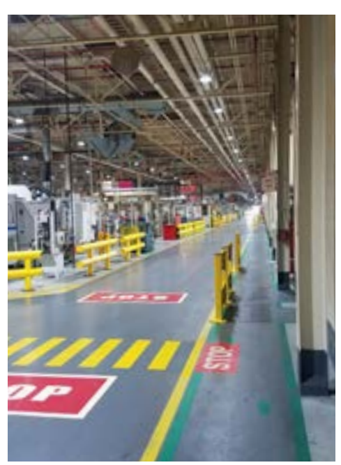
After LED retrofit